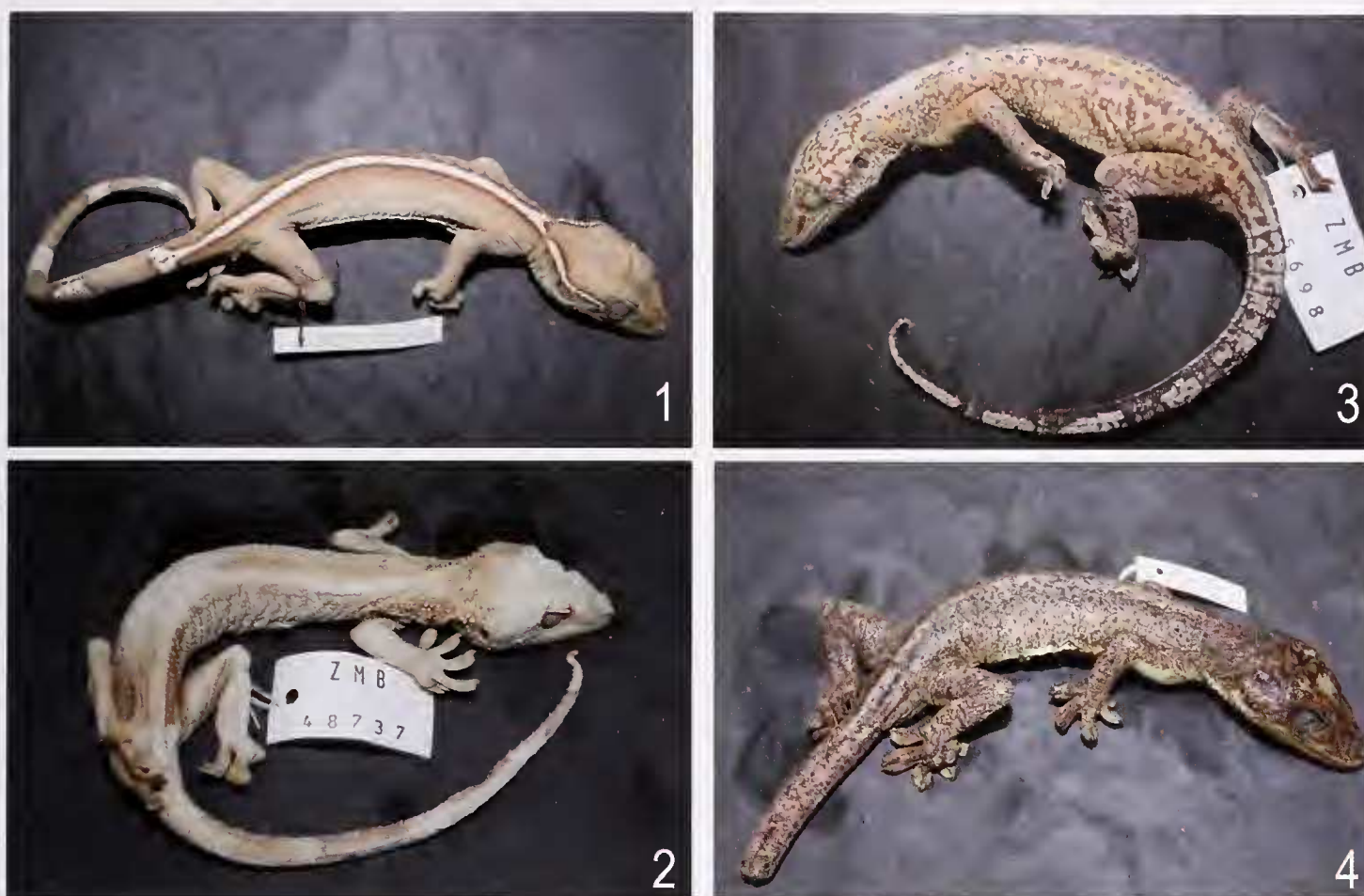
Figs 1–4. 1. Gekko vittatus phenotype 1, ZFMK 20612, male, Pulau Ambon, Indonesia; 2. Gekko vittatus s.l. phenotype 2 (sp.n.), ZMB 5698, female, Republic of Palau; 3. Gekko vittatus s.l. phenotype 3, ZMB 48737, male, Kei Islands, Indonesia; 4. Gekko vittatus s.l. phenotype 4, SMF 9159, male, Nissan Atoll, Green Islands, Papua New Guinea.

data obtained from 21 specimens [28 characters; including specimens from all four phenotypes identified in the present study as well as one of the syntypes of G. bivittatus (MNHN 6714) and the holotype of G. trachylaemus (ZMB 7511)] revealed that the two respective type specimens fall far outside of the remaining clusters. Hence, and supported by the finding that more differences in colouration are present between those two nominal taxa and the four phenotypes of G. vittatus s.l. (see next paragraph), we consider the evaluation of the taxonomic status of G. bivittatus and G. trachylaemus as not within the scope of the present study, because we shall deal with these nominal taxa in detail in a forthcoming paper.